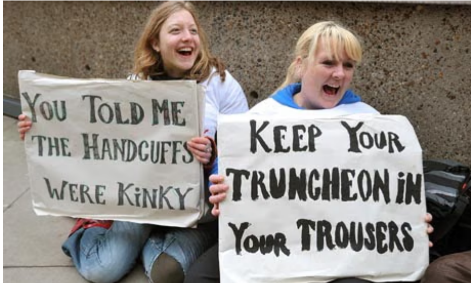
Demonstrators make their point at New Scotland Yard.

Women were 'unable to give informed consent', say demonstrators who blocked entry to New Scotland Yard